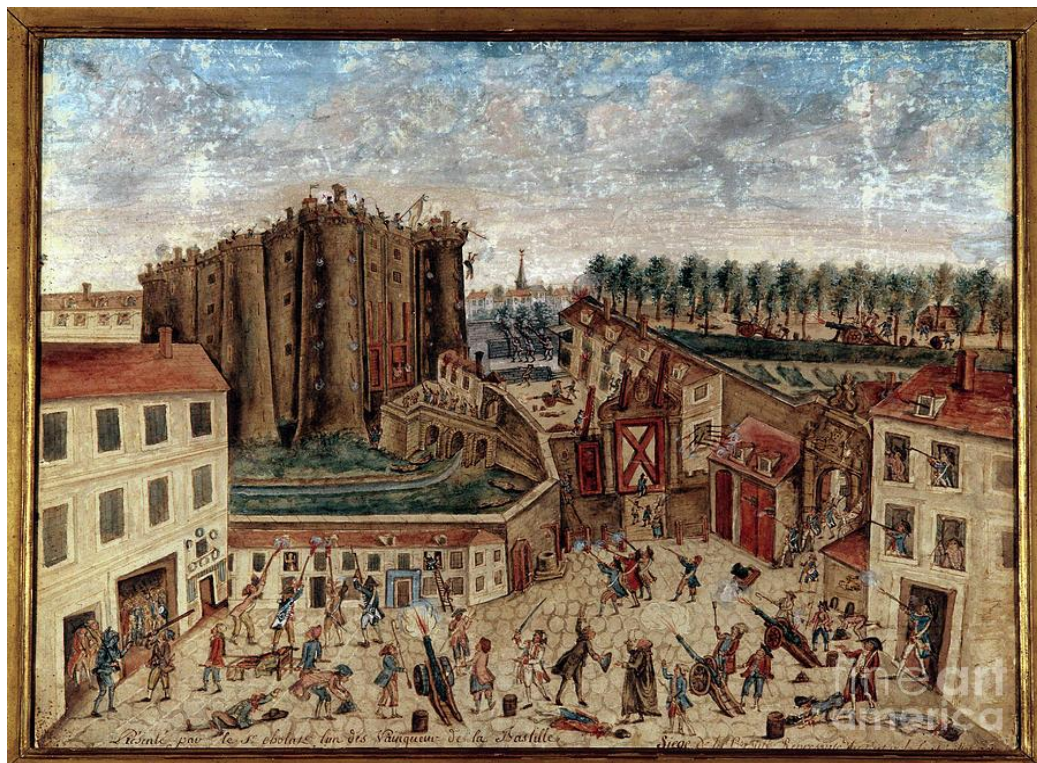
The capture of the Bastille as seen by one of the combatants, the wine shop keeper Claude Cholat—all events are compressed in one image