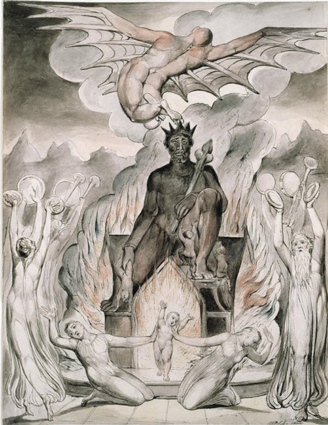
William Blake – The Flight of Moloch – 1809