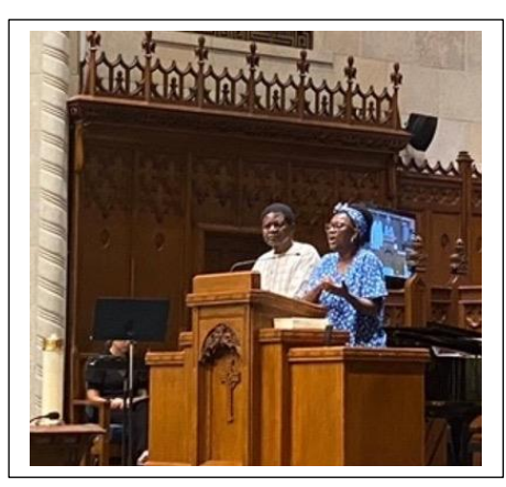
From the pulpit