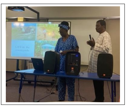
Speaking in Sunday School