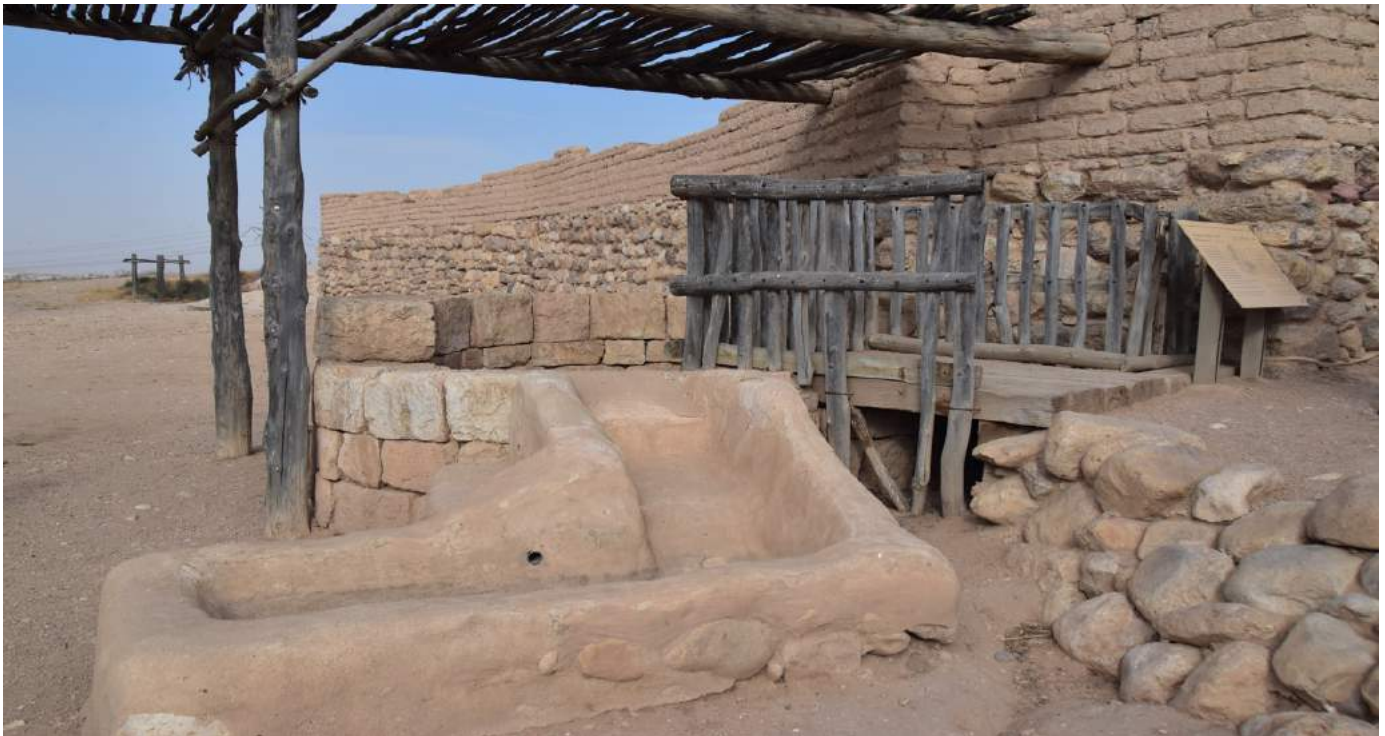
Bronze Age well outside the gates of ancient Beesheba, in today's Negev