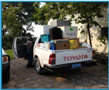
The 5th refrigerator for the hospital in Vanga

Several St. Louisans are currently traveling to Vanga. This shows their truck full of supplies and heading out for the long arduous trip to Vanga. If you remember in previous posts, they have several old refrigerators. Just a year ago their newsletter was telling of the difficult terrain they had to cross to deliver it, not to mention locals who had to be talked into clearing room for the truck to pass. Currently they have four refrigerators that are not working and #5 is loaded on this truck. It will be welcomed with open arms.