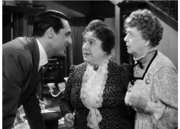
Cary Grant, Josephine Hull, and Jean Adair in Arsenic and Old Lace

I suspect a good number of Americans went to Sportsman's Park or the opening of Arsenic and Old Lace to escape for a couple hours—two months from D-Day and waiting for loved ones to return home.