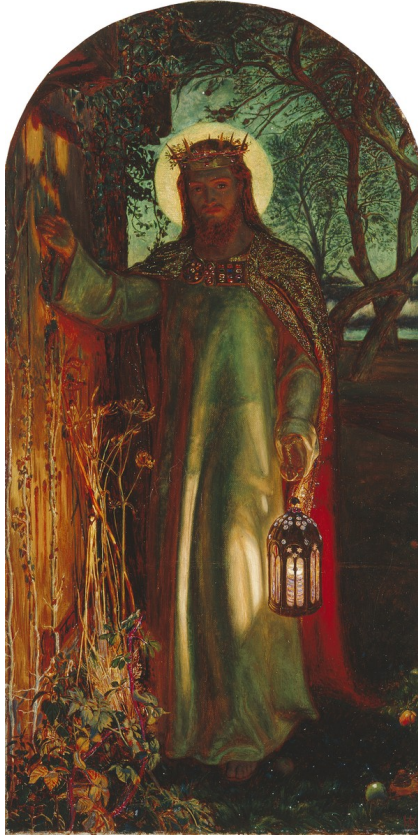
William Holman Hunt – The Light of the World – 1851-1856