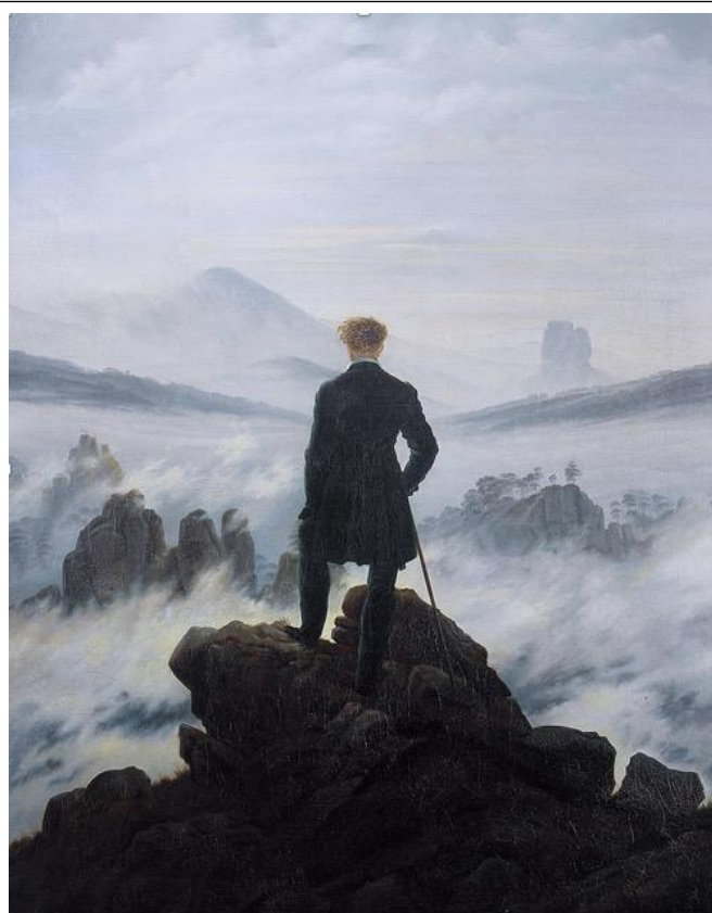
Caspar Friedrich, Wanderer Above the Sea Fog , 1818