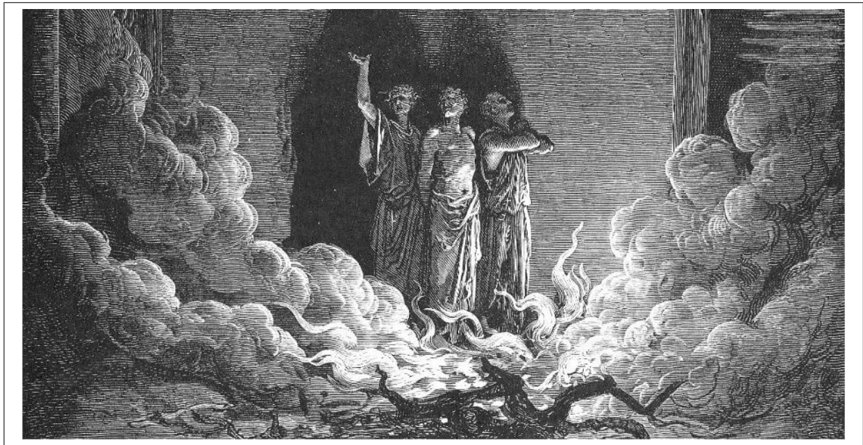
Shadrach, Meshach and Abednego in the Furnace, by Gustave Doré

I was Licensed to the ministry July 10, 1977, at Braeburn Valley Baptist Church in Houston, Texas.