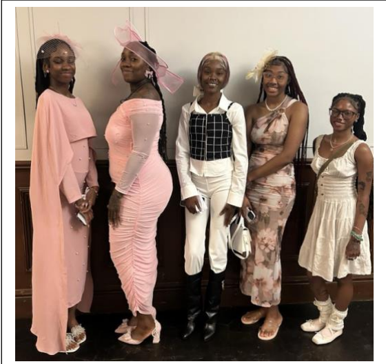
Hat contest winner (second from left) and entourage!