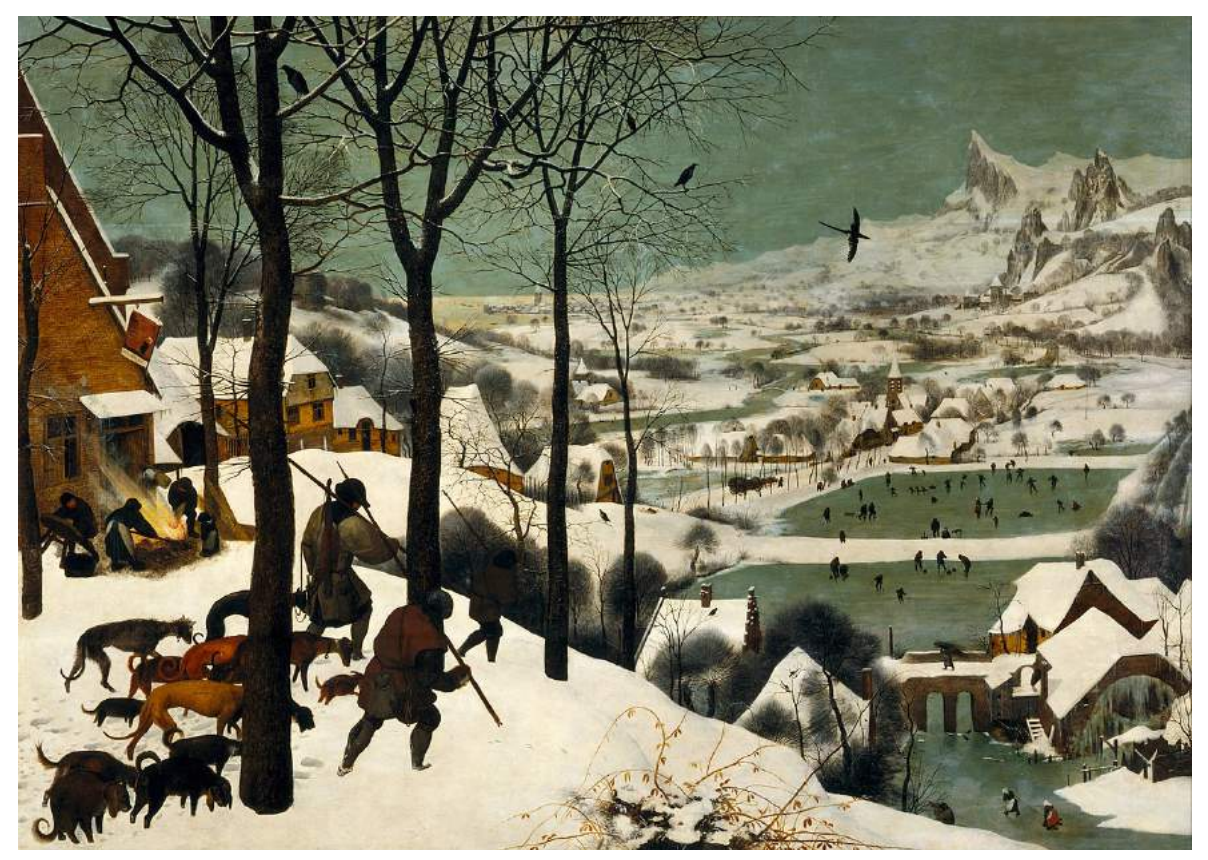
Pieter Bruegel : Hunters in the Snow, 1566