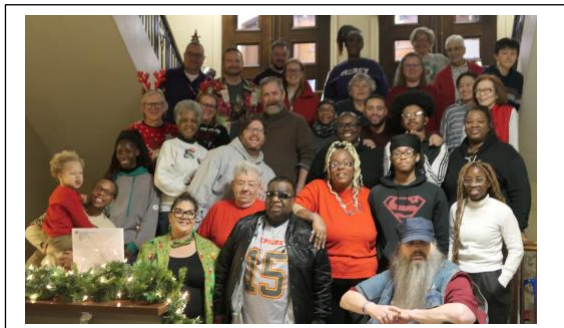
An army of cheerful volunteers