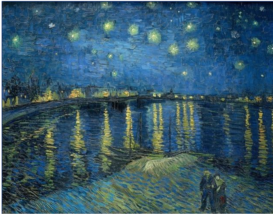
Starry Night Over the Rhone, by Vincent Van Gogh (September 1888)

Neil de Grasse Tyson, astrophysicist, popular author, and science communicator was discussing Artificial Intelligence with Bill Maher.