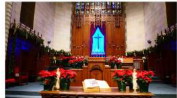
Jesse Tree Advent Devotional 2023

There are 25 days of devotionals that have 25 symbols and 25 stories. I hope these will enhance your Advent as you work through and discuss at home. Our youth will be following the Advent calendar on Wednesdays and in Sunday School and the first and the second and fourth Sundays we will have Godly Play following the Advent calendar during worship.