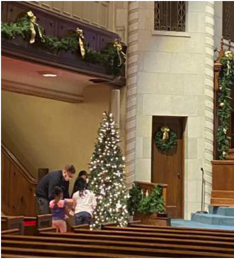
Christmas Eve Service 5 p.m.

Christmas Eve & New Year's Eve Services: No change in Sunday morning schedule Donut Fellowship 10 a.m. Bible Study 11 a.m. Worship