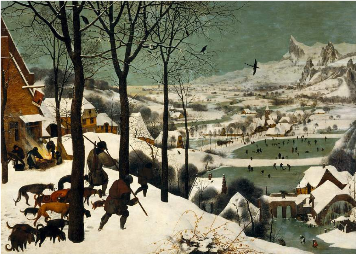
Pieter Bruegel : Hunters in the Snow , 1566