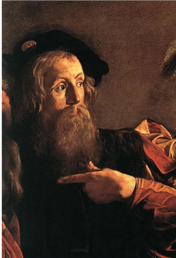
Caravaggio – The Calling of St. Matthew (The Bearded Man) – 1599